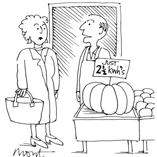
It's the new Lewes currency madam

This list is not necessarily comprehensive.